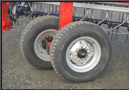
OFFSET DUAL WHEELS FOR MORE STABILITY