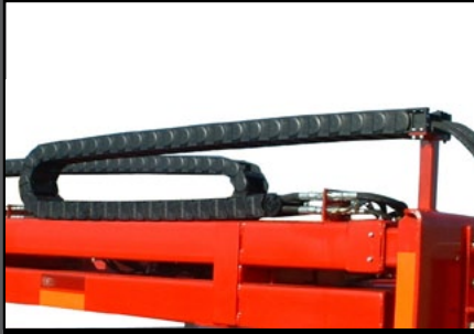
"HOSE TRAC" HOSE PROTECTION