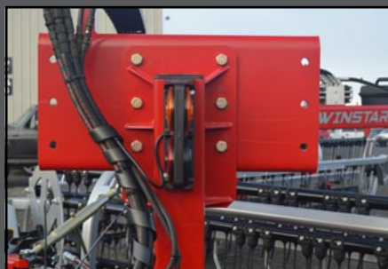
SLIDE TUBES EQUIPPED WITH 3 BASKET POSITIONS FOR OFFSETTING BASKETS

Front and rear gauge wheels (highly recommended), full tines (for lighter crop conditions), 2-5/16" ball hitch, 4 hose kit (for tractors with less than 12 GPM per remote), high torque motors in lieu of heavy duty motors (for heavy crop applications such as oat hay and silage), and basket angle stop kit.