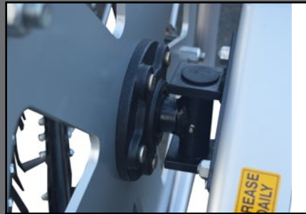
SELF-ALIGNING IDLER HUBS