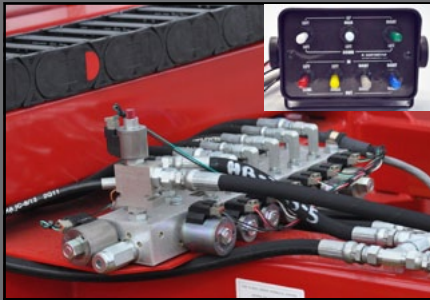
6-FUNCTION ELECTRIC HYDRAULIC VALVE & CONTROL BOX