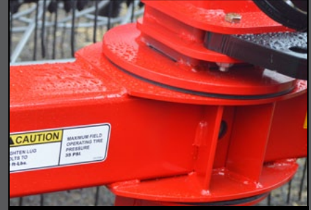
HEAVY-DUTY BASKET PIVOT w/ UHMW SHIMS BASKETS ARE SHEAR BOLT PROTECTED