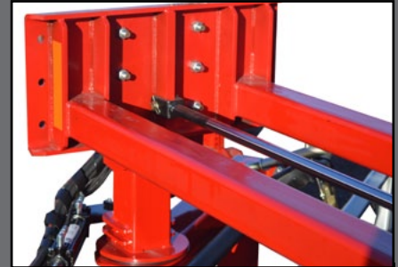
DOUBLE EXTENSION TUBES FOR ADDED STRENGTH