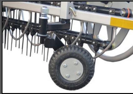
FRONT & REAR GAUGE WHEELS