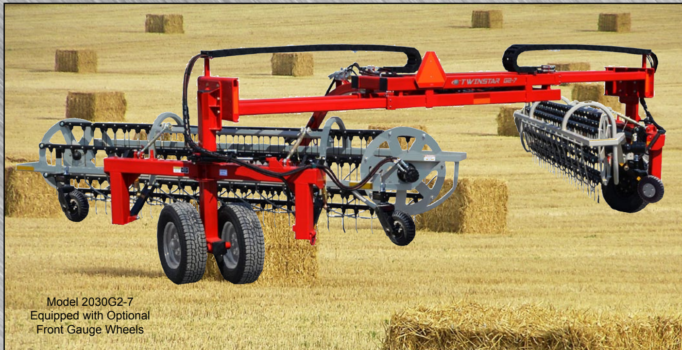
Model 2030G2-7 Equipped with Optional Front Gauge Wheels

Cleaner Hay Means Higher Returns and More Nutrients in Hay and Silage!