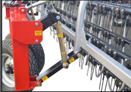
BASKET HEIGHT ADJUSTMENT LINK