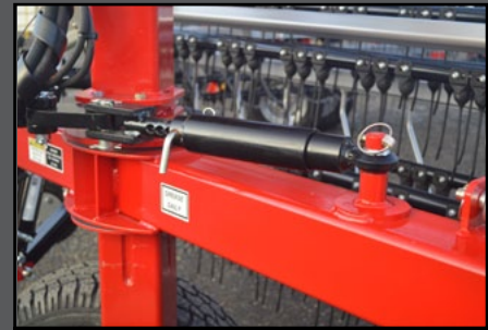
OPTIONAL BASKET ANGLE STOP KIT