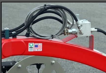
HYDRAULIC MANIFOLD PROTECTS THE RAKE'S HYDRAULIC SYSTEM