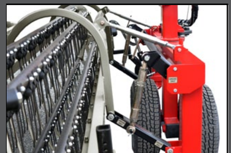
PARALLEL LINKAGE TORSION BASKET SUSPENSION