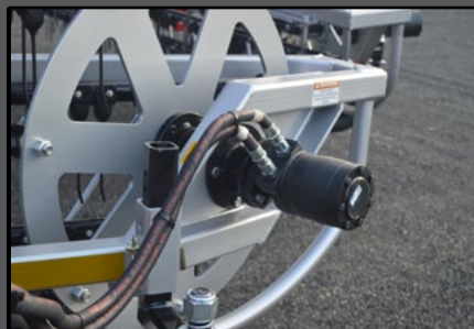
EQUIPPED W/ HEAVY DUTY MOTORS OPTIONAL HIGH TORQUE MOTORS